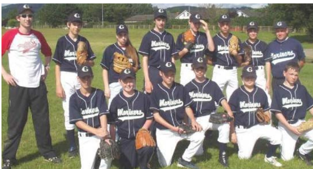
Greystones Mariners... Familiar faces?